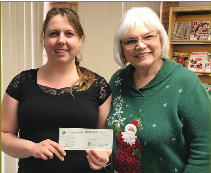
Dudley Township Library (Satanta)

From all of us at the Foundation, we hope you had a very merry Christmas and we look forward to seeing you in the New Year.