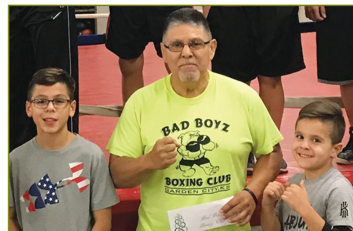
Bad Boyz Boxing (Garden City)