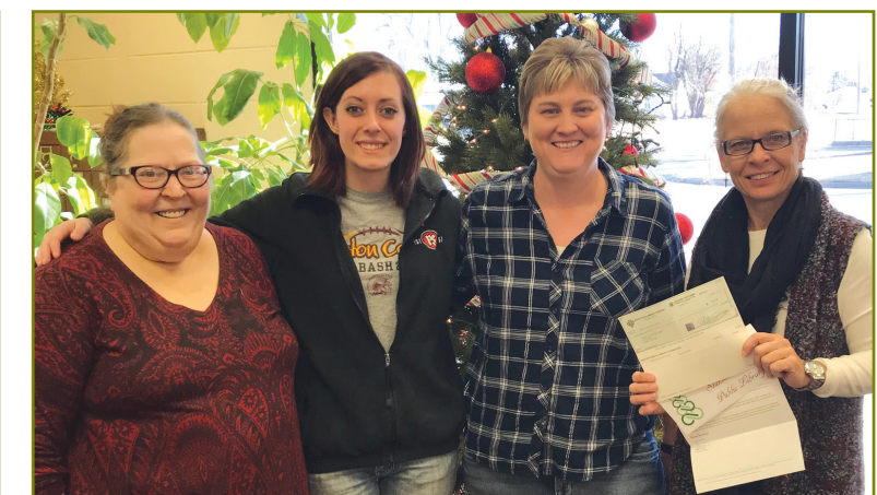
Stanton County Library (Johnson)