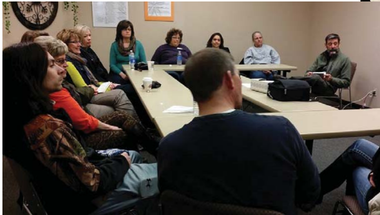
Engaged citizens learning about walk audits and how to see their community through the lens of active living.