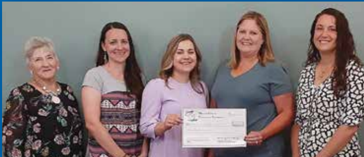
Heart Strings to Purse Strings giving check to childcare center board members.

The largest grant made to date by Western Kansas Community Foundation was awarded to Wichita County's Grow & Learn Childcare Center to continue the momentum in the creation of the much-needed childcare facility.